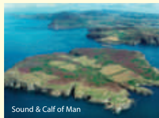
Sound & Calf of Man

The Sound Restaurant and Visitor Centre is also situated nearby and offers spectacular panoramic views of Manx coastal scenery and the Calf of Man.