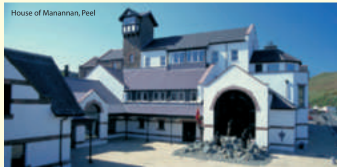
House of Manannan, Peel

In the West of the Island, you can enjoy a visit to the House of Manannan in Peel where you are greeted by the Island's mythological sea god Manannan,