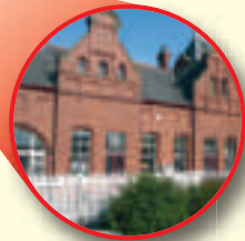
Douglas Steam Railway Station