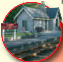
Castletown Railway Station