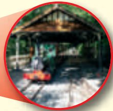
Groudle Glen Railway