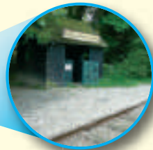
Ballaglass MER Station